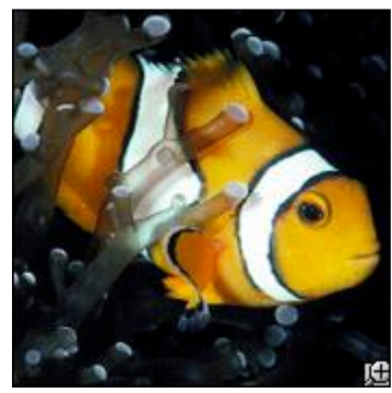
Male Today, Female Tomorrow

In the case of the clownfish, a favorite of aquarium-lovers, the gender bending is taken to extremes — males can not only switch to female, but also increase in size to become the alpha-breeder in their piscatorial group.